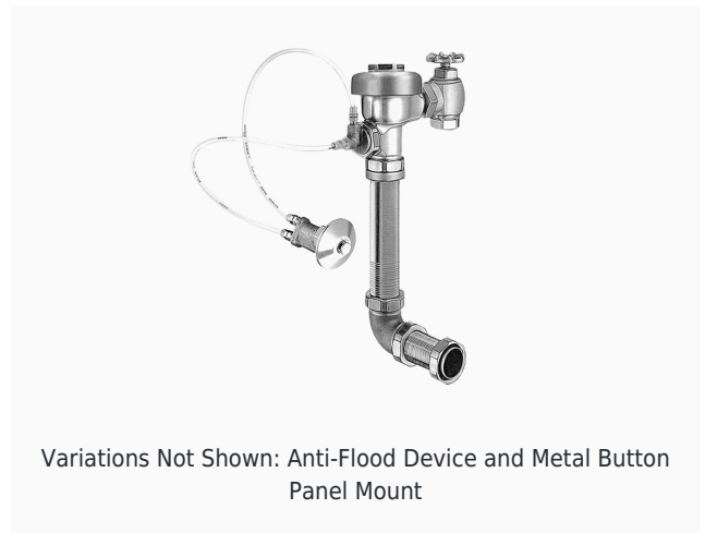
Variations Not Shown: Anti-Flood Device and Metal Button Panel Mount