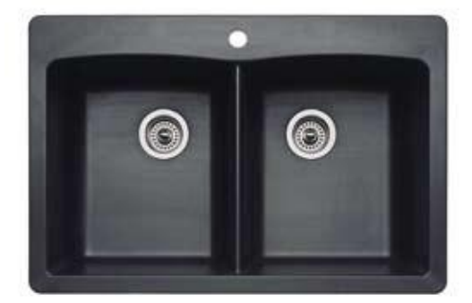
Model LX440220 shown in ANTHRACITE

LX440220 Double Bowl, 9-1/2" bowl depths, ANTHRACITE LX440218 Double Bowl, 9-1/2" bowl depths, CAFÉ BROWN LX440221 Double Bowl, 9-1/2" bowl depths, WHITE LX440222 Double Bowl, 9-1/2" bowl depths, BISCUIT LX440219 Double Bowl, 9-1/2" bowl depths, METALLIC GRAY LX441217 Double Bowl, 9-1/2" bowl depths, BISCOTTI LX441285 Double Bowl, 9-1/2" bowl depths, TRUFFLE LX441466 Double Bowl, 9-1/2" bowl depths, CINDER