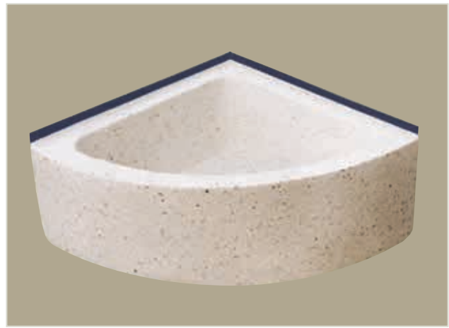
Shown: Model 97

2851 Falcon Drive • Madera, CA 93637 T. 559.661.4171 • T. 800.446.8827 F. 559.661.2070 • florestone.com